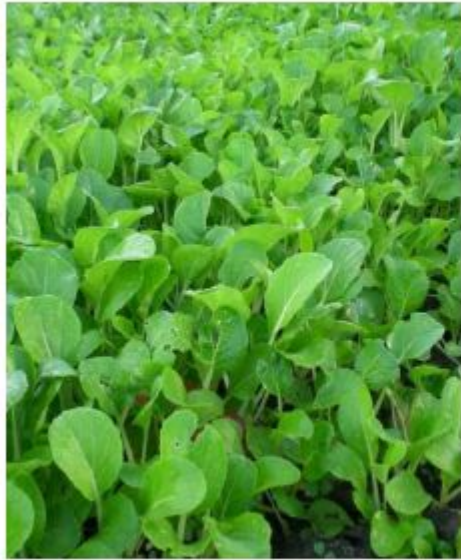
Fotsitaho Brassica campestris amplexicaulis