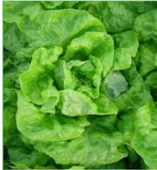
Salady Lactuca sativa