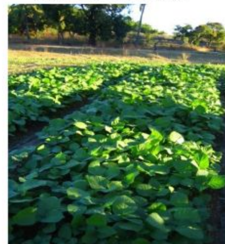
Anamamy Solanum nigrum