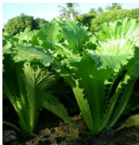
Petsai Brassica campestris nekinensis