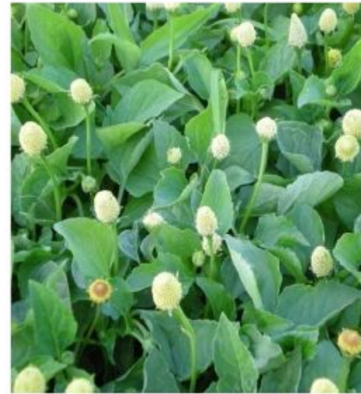
Felimafana Acmeilla oleracea